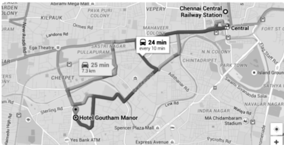
Prominent Landmark : Next to Sangeetha Hotel, Nungambakkam